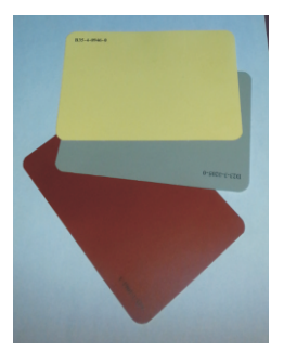
The new common room colours chosen by the women in residence.