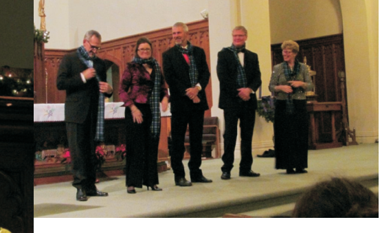
Presentation of scarves