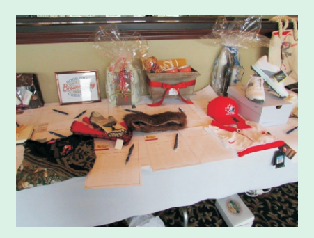
Silent Auction Table