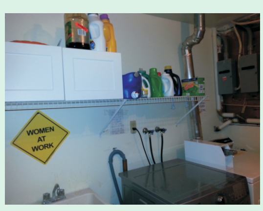
Residence doing a great job of keeping the laundry room neat and tidy.

Gift Cards to: Giant Tiger, Metro Walmart Orillia Square Mall