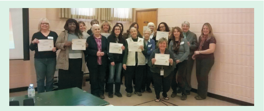
Congratulations to the staff and volunteers of CJH and partners for successfully completing safeTALK training. (suicide alertness for everyone) To learn more about safeTALK please visit www.livingworks.net